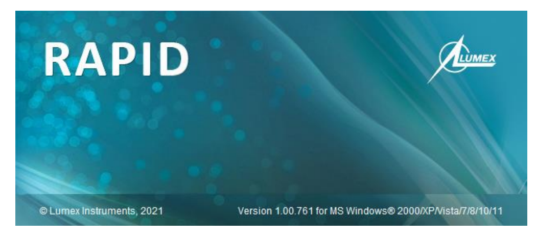
Fig. 2 RAPID splash screen

5 The software splash screen will appear. (Fig. 2).