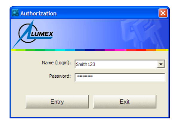
Fig. 3 Authorization dialog

After the splash screen disappears, the Authorization window opens (Fig. 3 Fig. ). Choose the user's name from the Name (Login) drop down list, enter the password in the Password text field and press the Entry button. The Exit button is designed for exiting from the software.